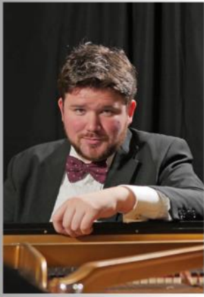
Nenad Ivović Piano