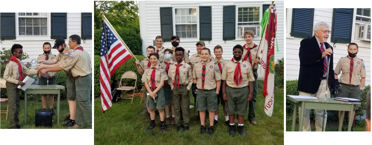
Boy Scout Court of Honor, June 17, 2021